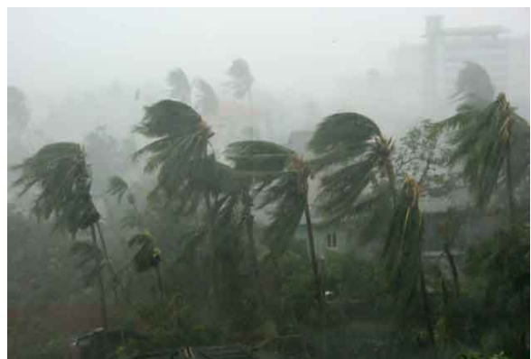
Fig. 10. Effect of high wind velocity on Tall trees.