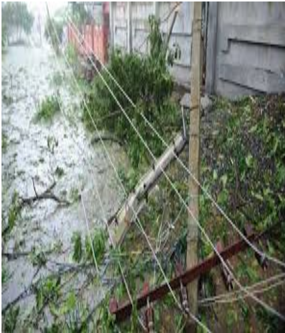
Fig. 6. Damaged power lines.