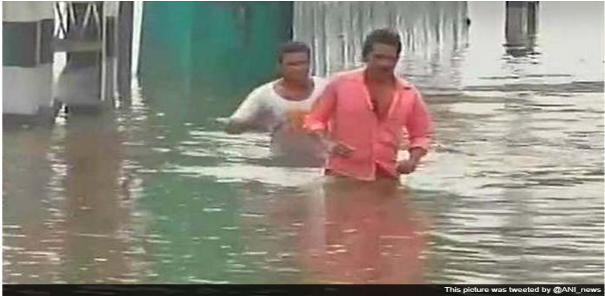
Fig. 2: Floods after Hudhud.