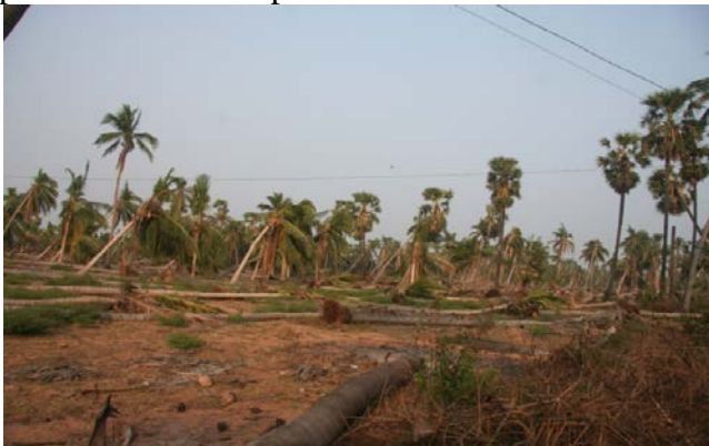
Fig. 9. Damaged Coconut Trees