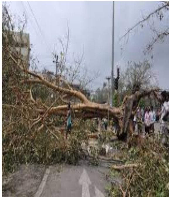
Fig. 7. Fallen trees

1.6. In A.P., about 9.2 million people in over 7285 villages in 4 coastal districts were affected resulting in 61 human casualties. The timely action of Govt. of India and State Government after the Cyclone warning resulted in minimum casualties. Over 2,22,000 people were evacuated from low lying and vulnerable areas to 310 relief camps. In addition, 1688 medical camps were opened, about 2.9 million food packets and 6.5 million water packets were distributed over a period of 15 days . This was made possible with the efforts of the Govt. of A.P. in close collaboration with district authorities, local self Government, National Disaster Response Force (NDRF), Indian Army and Navy.