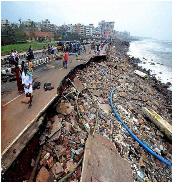
Fig. 4. Damaged Road.