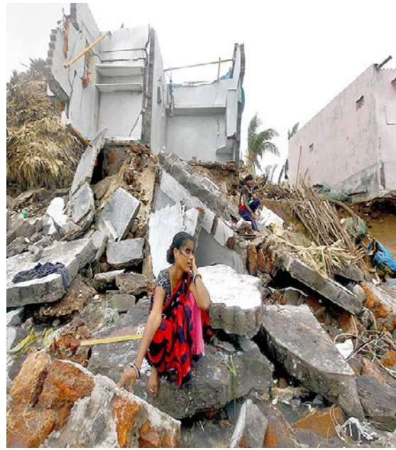
Fig. 5. Damaged Buildings.