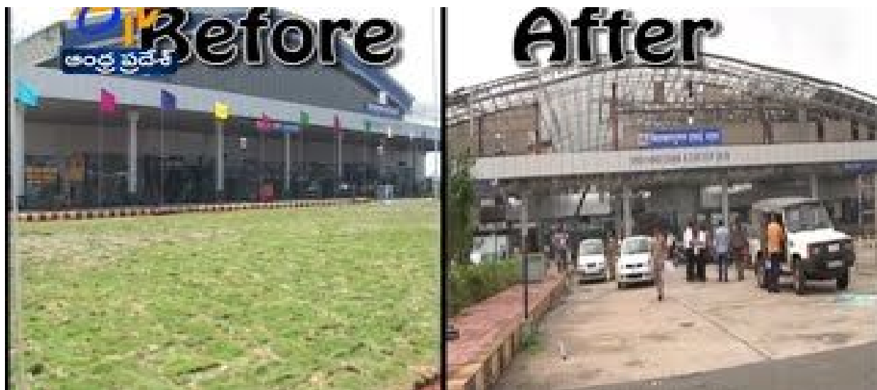
Fig. 8. Vishakhapatnam Airport before and after cyclone Hudhud.

Figure 8 depicts the position of Airport before and after Cyclone.