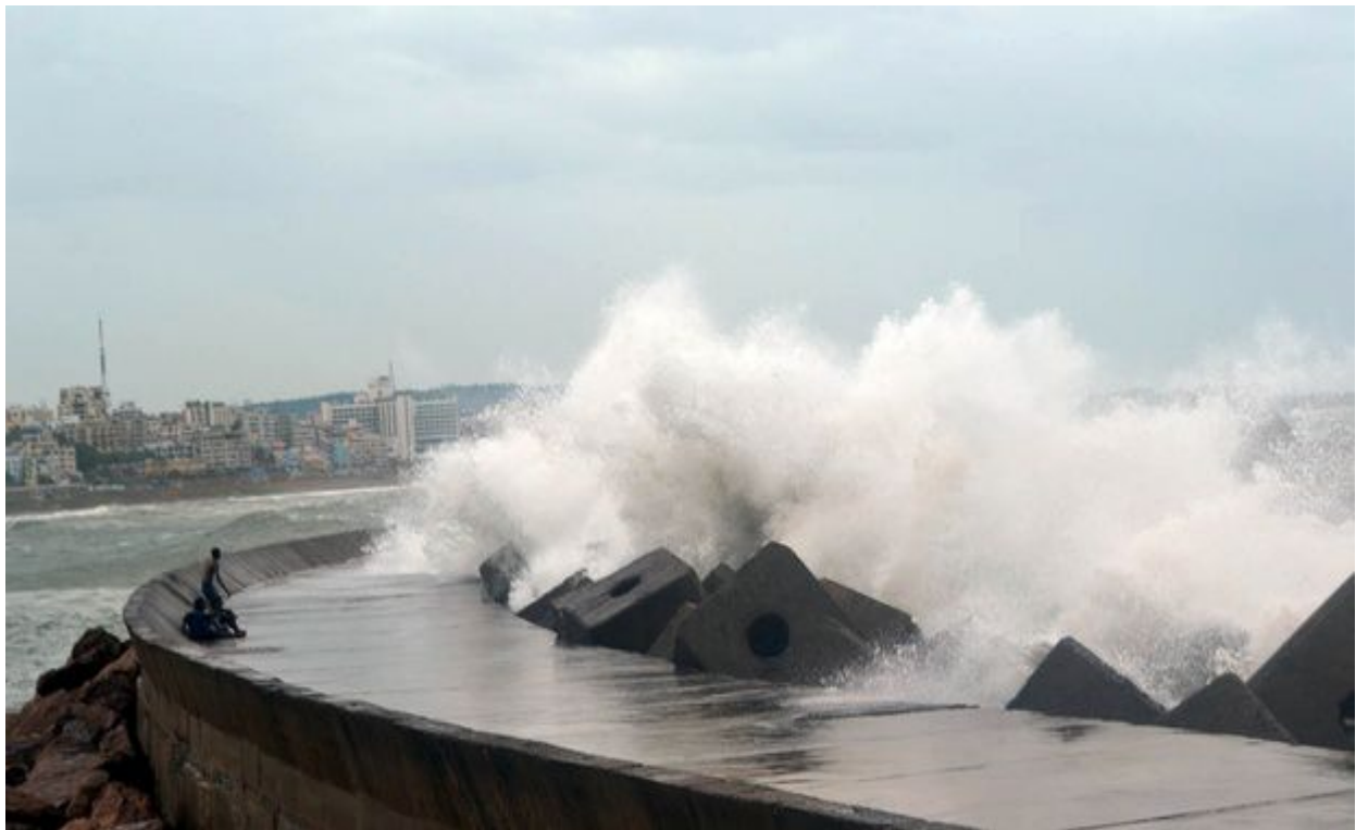
Fig. 3: Storm surge during Hudhud.

1.5. The Cyclone Hudhud caused extensive devastation in the affected districts, wherein large number of trees were uprooted, roads and buildings were severely damaged, and power and telecommunication infrastructure was disrupted.